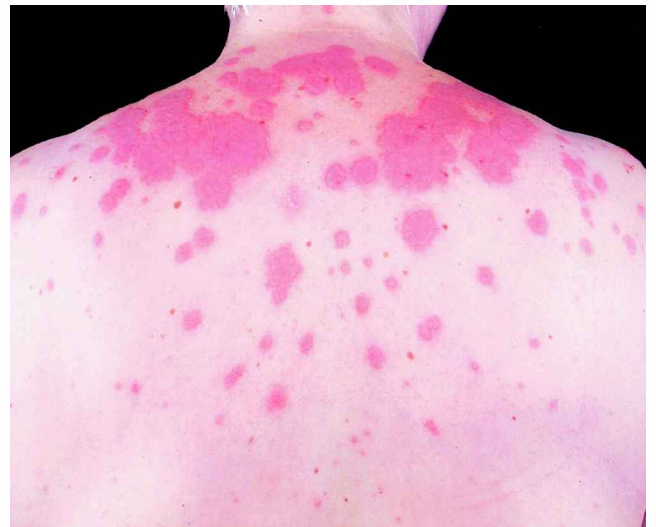
Figure 1 The typical skin lesions of Sweet's syndrome.

Histology from skin biopsy revealed an acute inflammatory infiltrate in the upper dermis with neutrophils and leucocytoclasia; lymphocytes, plasma cells and eosinophils were present. There was perivascular chronic inflammatory cell infiltrate. The