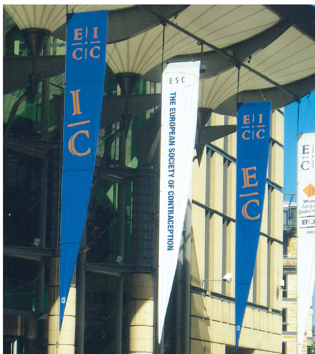
Figure 1 The venue for the 8th Congress of the ESC, the Edinburgh International Centre

A record number, in excess of 1500, of doctors and others, from all over Europe and beyond, gathered at the Edinburgh International Conference Centre (Figure 1) on the occasion of the 8th Congress of the European Society of Contraception (ESC). As well as people from most European countries, I encountered doctors from Chile and Australia. As expected, Edinburgh provided a warm