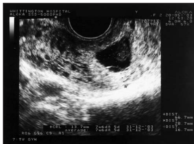
Figure 1 Transvaginal ultrasound scan showing a gestation sac and embryo in the right ovary

Histology confirmed sections of ovary showing several chorionic villi of the first-trimester type associated with an implantation site reaction by trophoblasts. Haemorrhage was evident within the ovary, which also contained a recent corpus luteum in keeping with ovarian pregnancy.