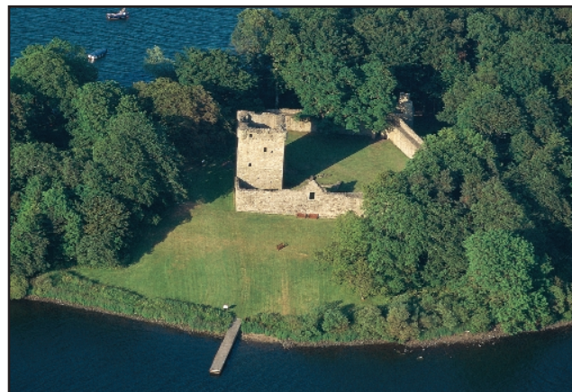
Figure 1 Loch Leven Castle in Kinross, Scotland, where Mary Stuart was imprisoned and where she is reported to have miscarried twins in 1567.

Elizabeth has been much criticised for holding Mary prisoner for so long without proper trial or evidence that she should be held. It was said at the time that Mary might well have been involved in the death of her second husband, Darnley, who was also the father of her son, James. Henry Darnley was murdered at Kirk O'Fields in