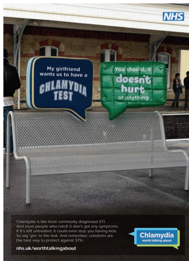
Figure 2 'Chlamydia Worth Talking About' campaign. Image from the advertising campaign showing two young men in a station setting.

So far, so fascinating. And on one level, I feel that sheer interest in the process justifies my exploration; it is surely always a worthwhile exercise to discover