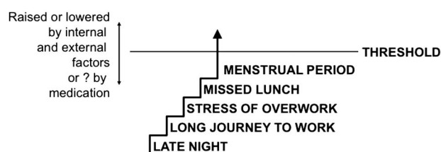
Figure 2 The threshold theory of migraine. Reproduced from MacGregor, 20 by permission of SAGE publications.

Episodic attacks result from internal and environmental triggers that combine to reach the attack 'threshold', which is likely to be genetically determined (Figure 2). 20 Crossing the threshold triggers