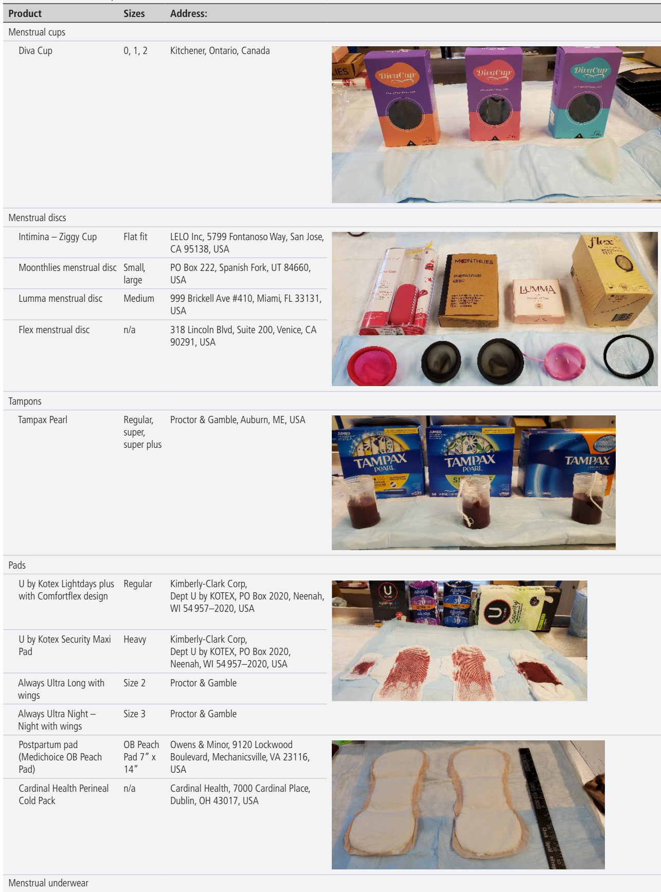
Table 1 Menstrual products used