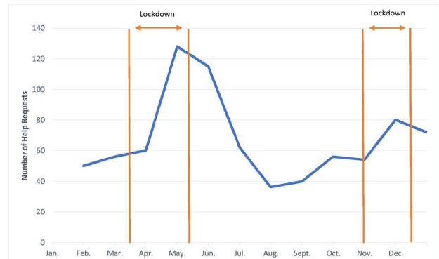
Figure 1 Number of telemedical abortion consultations from France received by Women on Web between 1 January and 31 December 2020 (n=809).

Table 1 summarises the background and pregnancy- and abortion-related experiences of women. Table 2 illustrates the reasons why women from France requested telemedicine abortion through WoW. We differentiated women's reasons according to age in