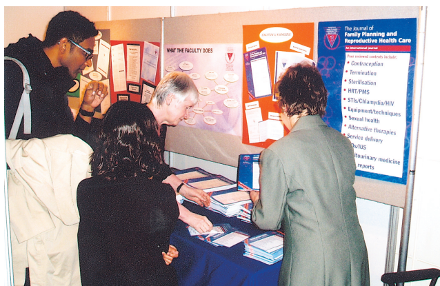
Figure 3 The Journal of Family Planning and Reproductive Health Care exhibition stand at the Congress