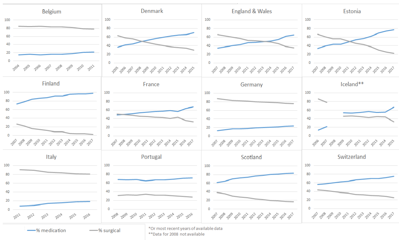
Figure 2 Proportion of medication and surgical abortions from 2007 to 2017*

for only about a third of all abortions in Canada.] New Zealand, Canada and Italy are the only countries where fewer than half of all abortions occurred at less than 9 weeks gestation; however, in all countries most abortions occurred by 10 or 11 weeks gestation. In