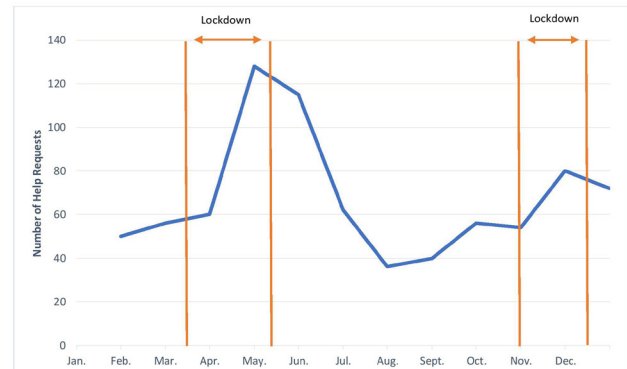
Figure 1 Number of telemedical abortion consultations from France received by Women on Web between 1 January and 31 December 2020 (n=809).

Table 1 summarises the background and pregnancy- and abortion-related experiences of women. Table 2 illustrates the reasons why women from France requested telemedicine abortion through WoW. We differentiated women's reasons according to age in